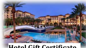
Hotel Gift Certificate